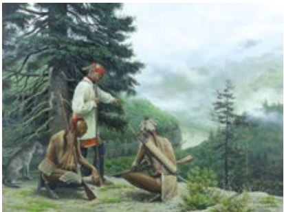
"The Unnoticed Observers" by H. David Wright 125 s/n canvas prints • 18" x 24" • $400.00