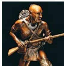
detail of "Silent Steps" by Wayne Hyde Bronze • Edition 35 • $4,500.00