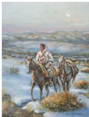
"Riding with the Cold Maker" by Kyle Carroll 13" x 10" oil • $1,500.00