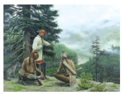
"The Unnoticed Observers" by H. David Wright 125 s/n canvas prints • 18"x 24" • $400.00