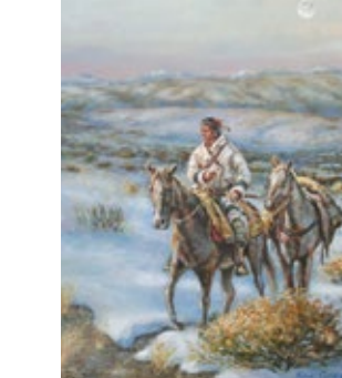
"Riding with the Cold Maker" by Kyle Carroll 13" x 10" oil • $1,500.00

*All artwork will be sold on a first come first served basis. No draw system will be applicable.