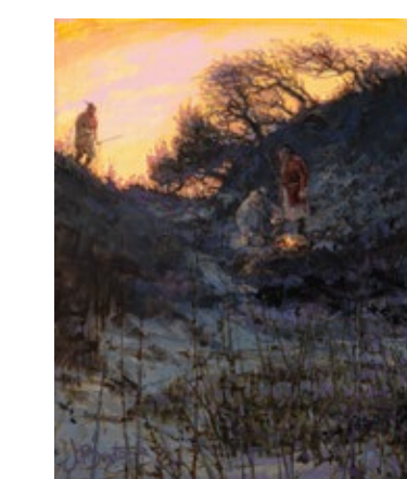
"Join us Brother" by John Buxton 11"x 14" oil • $6,000.00

*All artwork will be sold on a first come first served basis. No draw system will be applicable.