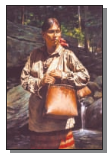
Water Girl by Robert Griffing 16" x 20" open edition ~ $40.00